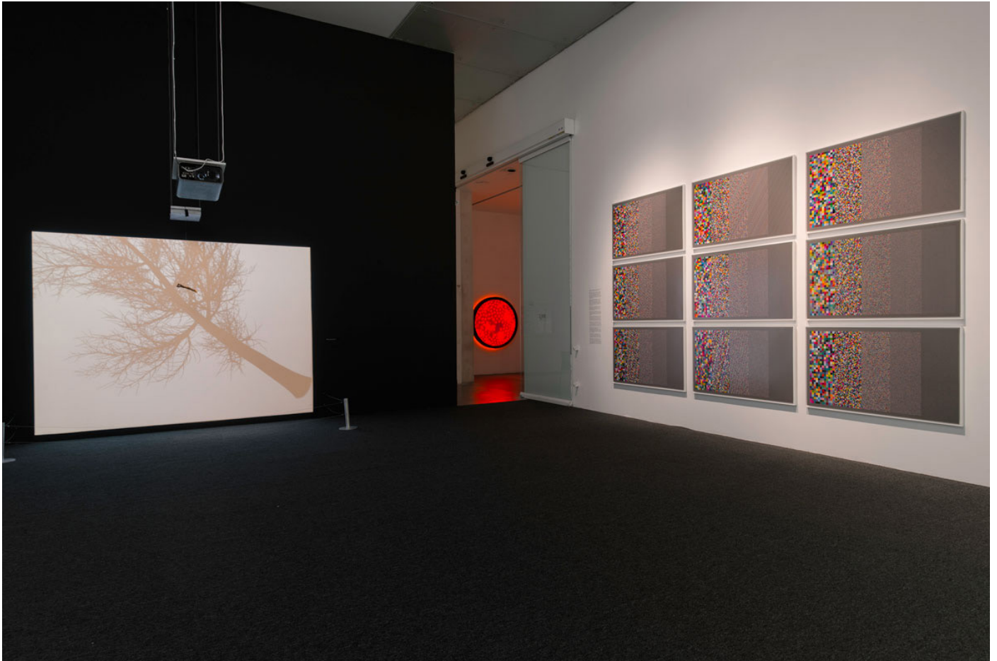
Exhibition Pseudomatismos Rafael Lozano-Hemmer.