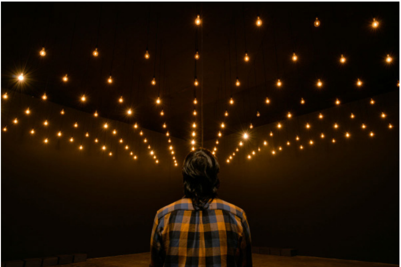
Exhibition Pseudomatismos Rafael Lozano-Hemmer.

The University Museum of Contemporary Art in Mexico City hosted the recent exhibition of the artist with outstanding sensory elements