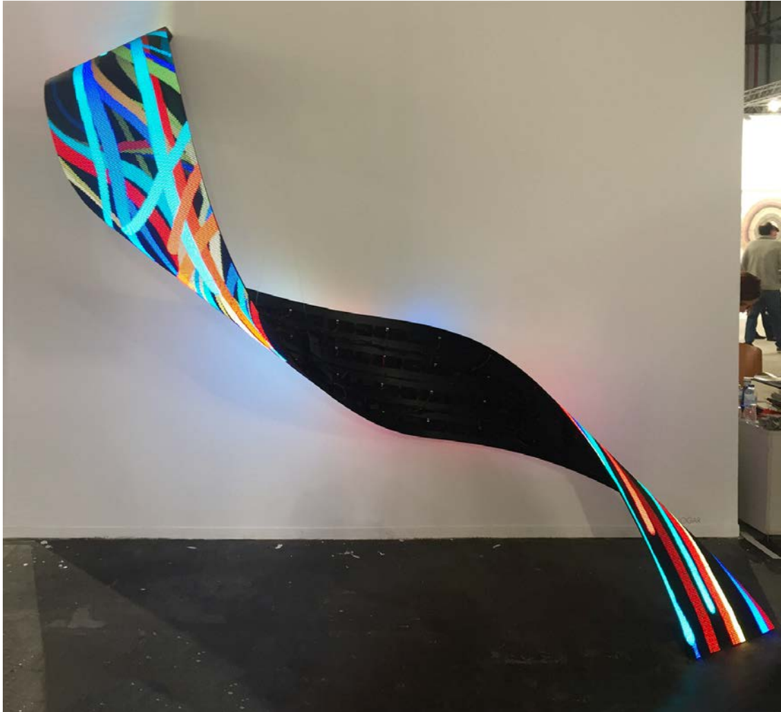
Daniel Canogar Surge V , 2018 Flexible LED screen, computer, custom software, internet connection, metal frame Dimensions variable 9.8 x 1.41 ft / 3 x .43 m, linear screen Edition of 3, 1AP

Video documentation: https://vimeo.com/387158929