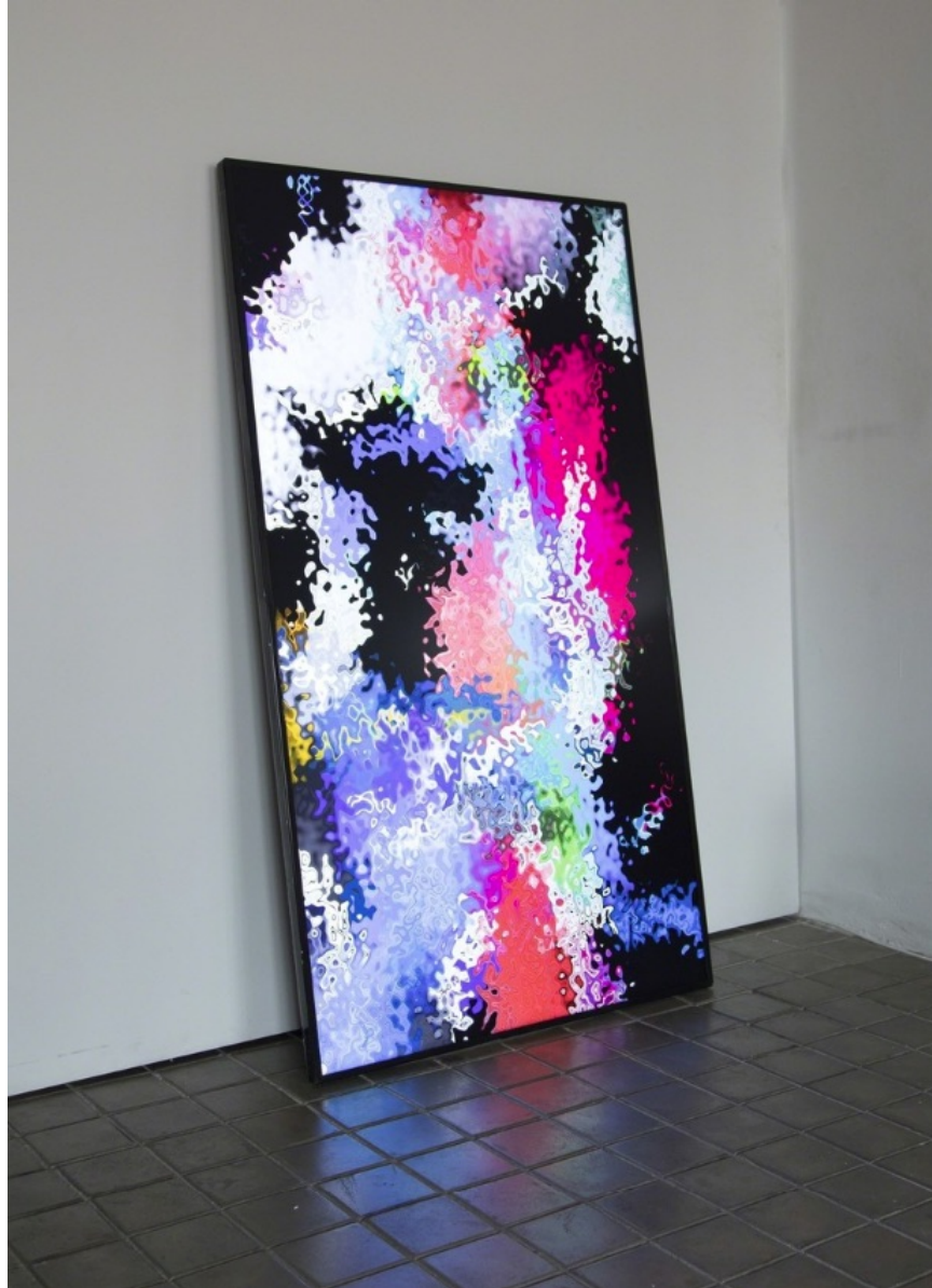
Daniel Canogar Ooze, 2017 Generative animation (color, silent), computer, internet connection, screen Edition of 7, 1 AP

Ooze utilizes the logos of the more than one hundred companies that make up the Nasdaq index fund as a source for generative animation. All logos appear liquefied, dissolving their bold designs into a hodgepodge of bright colors. The vertical movement of the animation faithfully reflects the ascending or descending market value of the companies, updated every ten seconds.