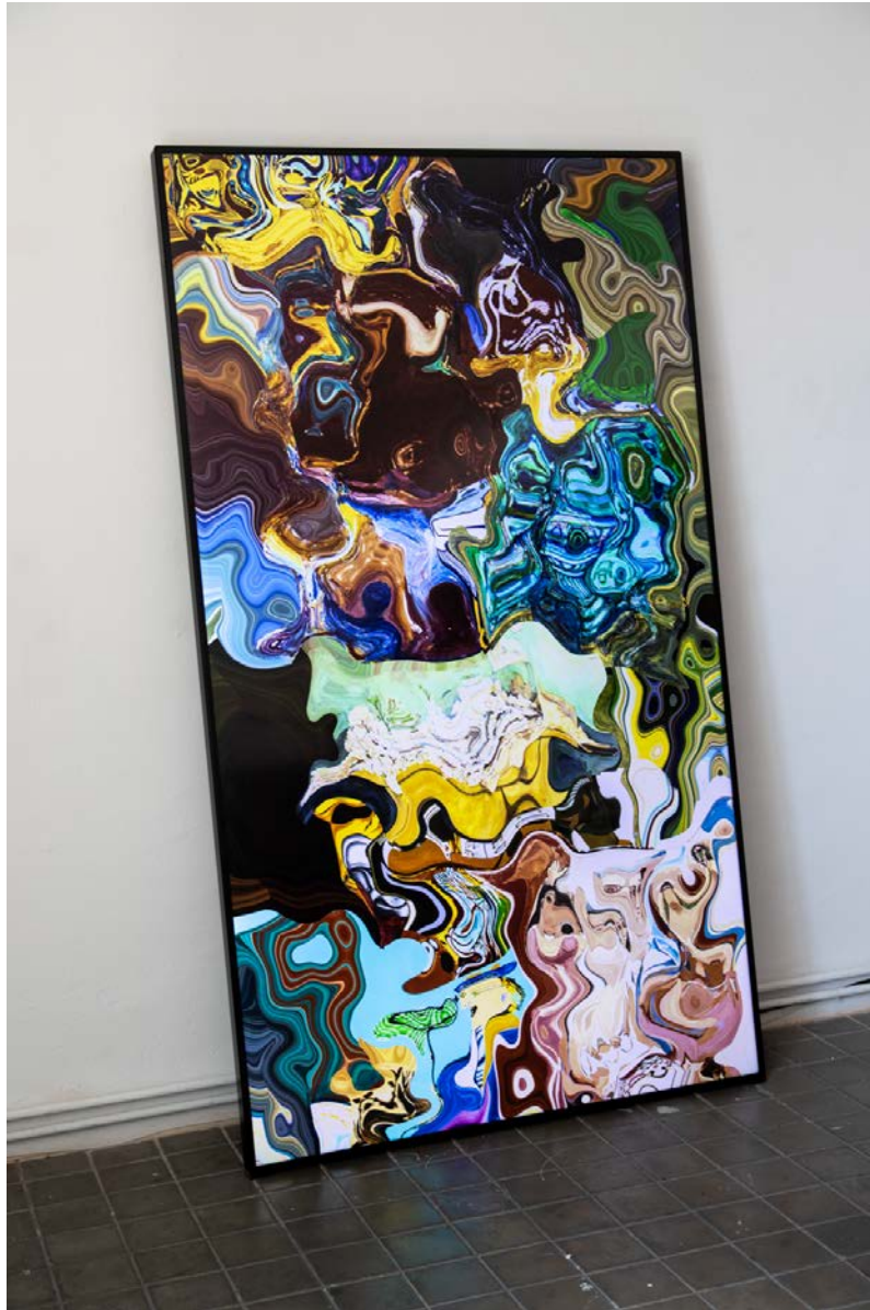
Daniel Canogar Amalgama , 2019 Generative animation (color, silent, computer, internet connection, screen) Dimensions variable, portrait orientation Edition of 7, 1AP

Video documentation: https://vimeo.com/328986050