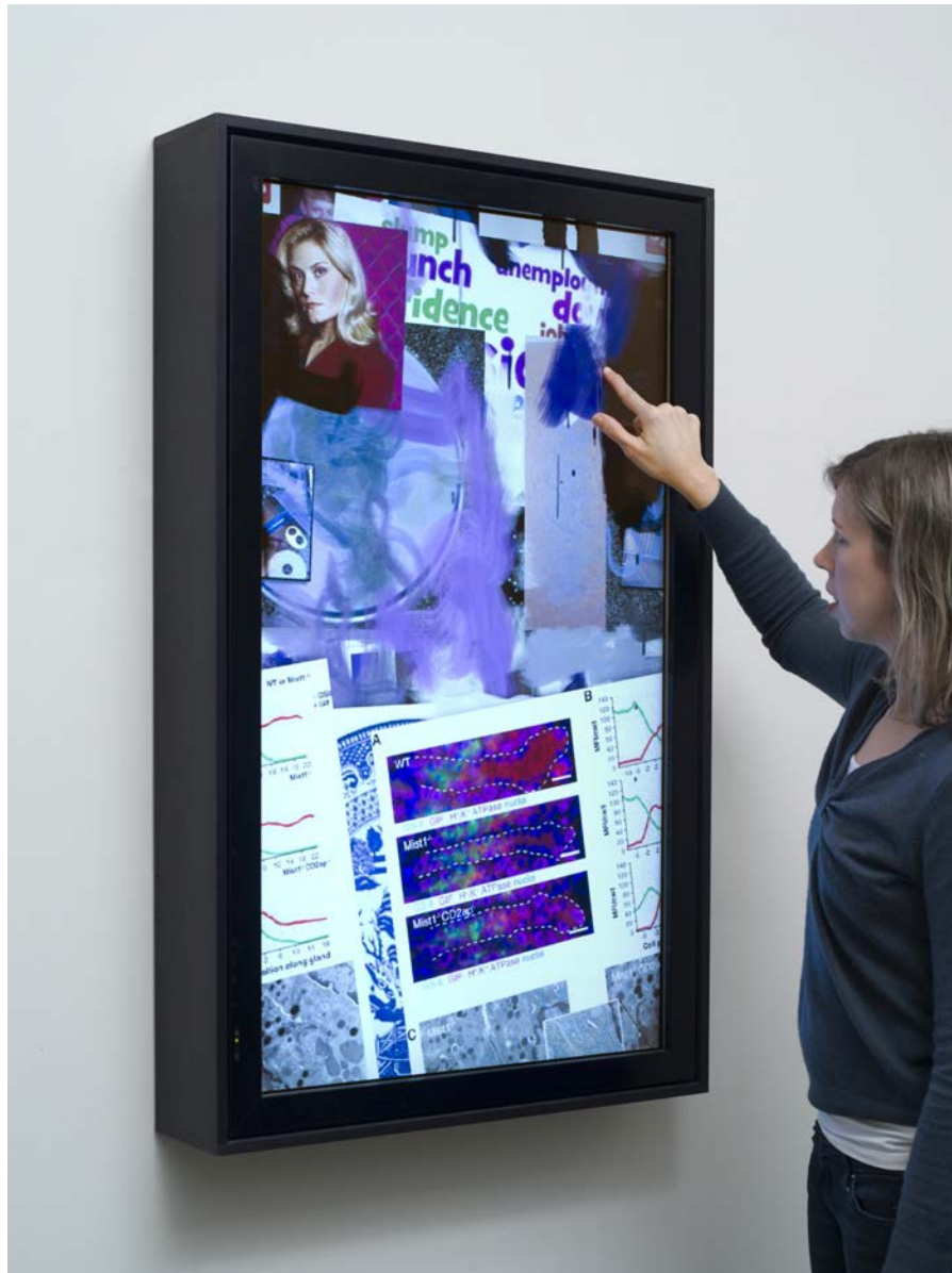
Siebren Versteeg In Light; of Everything, No. 7, 2010 Custom software (color, silent), computer, touch screen 43.5 x 26 x 6 in / 110.5 x 66 x 15.2 cm

Video documentation: https://vimeo.com/86152227